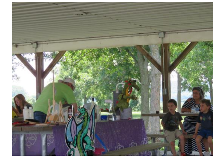
P R O G R A M S