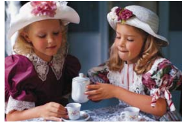
Support Library Programming by joining us Oct. 26th @ 4 PM for Tea!

If you would like to sponsor a table at the tea, you would need to bring place setting for 4 people, table decorations, and small party favor for the 3 people sitting at your table besides you. The library staff will provide the tea and refreshments. There will be a short